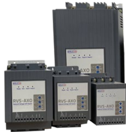
Range of Soft Starters, including both Low Voltage and Medium Voltage units, for a range of applications.

The RVS-AXO is designed with a simple interface for easy installation, in addition to a built in standard Modbus communication protocol that allows for remote monitoring giving the user a reduction of downtime and improved productivity.